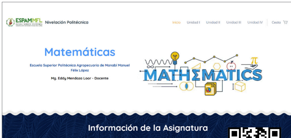
Figure 2. Home Page of the Mathematics Subject Website

Note. Through the following link, access is possible: https://eddymendoza.webnode.ec/ . Access to the website is also possible through the attached QR code.