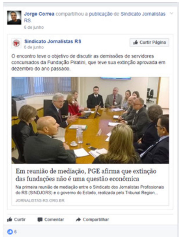
Figure 8 Category “trade unions.”