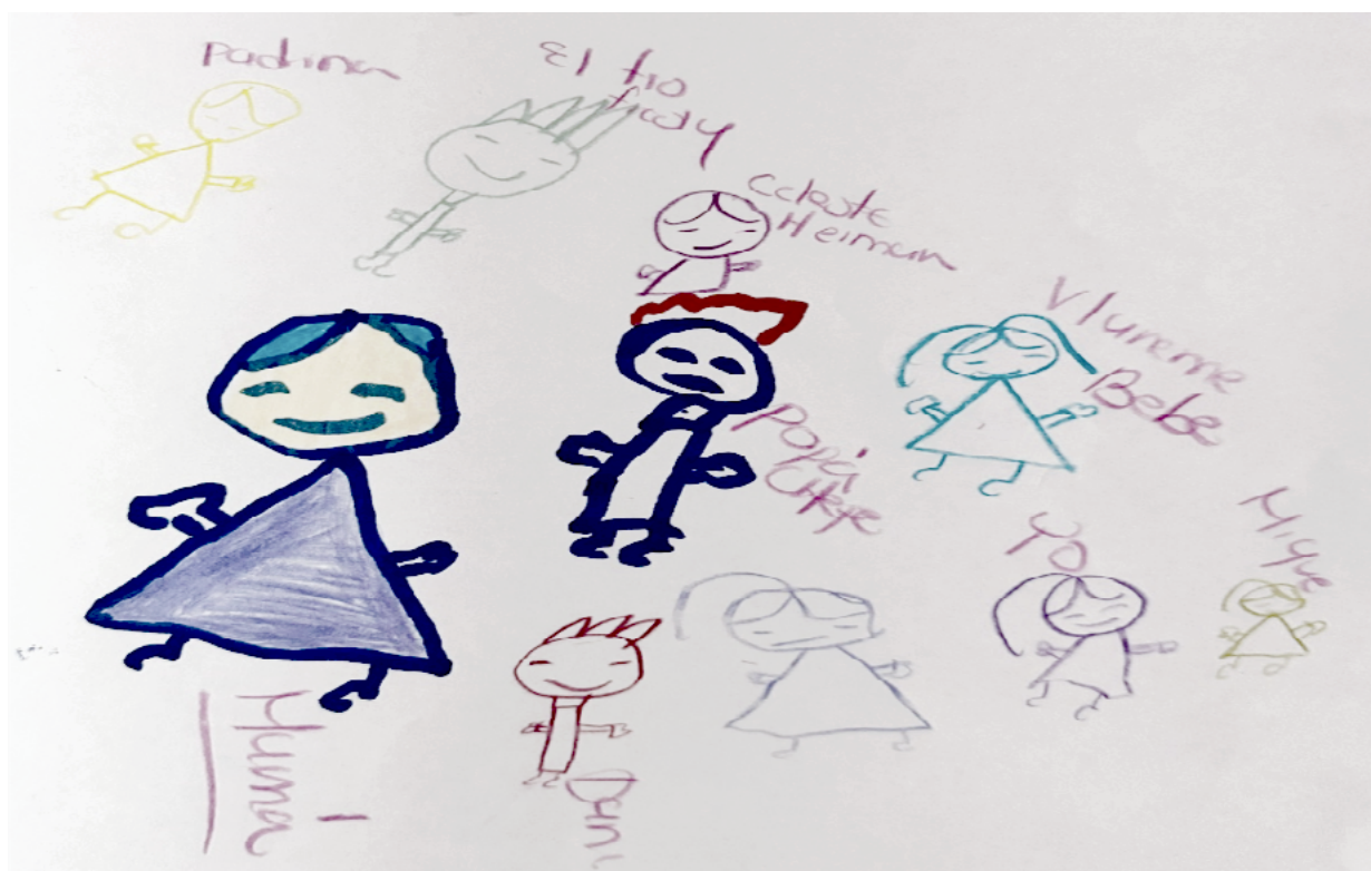
Figure 2. Extended family (2024)