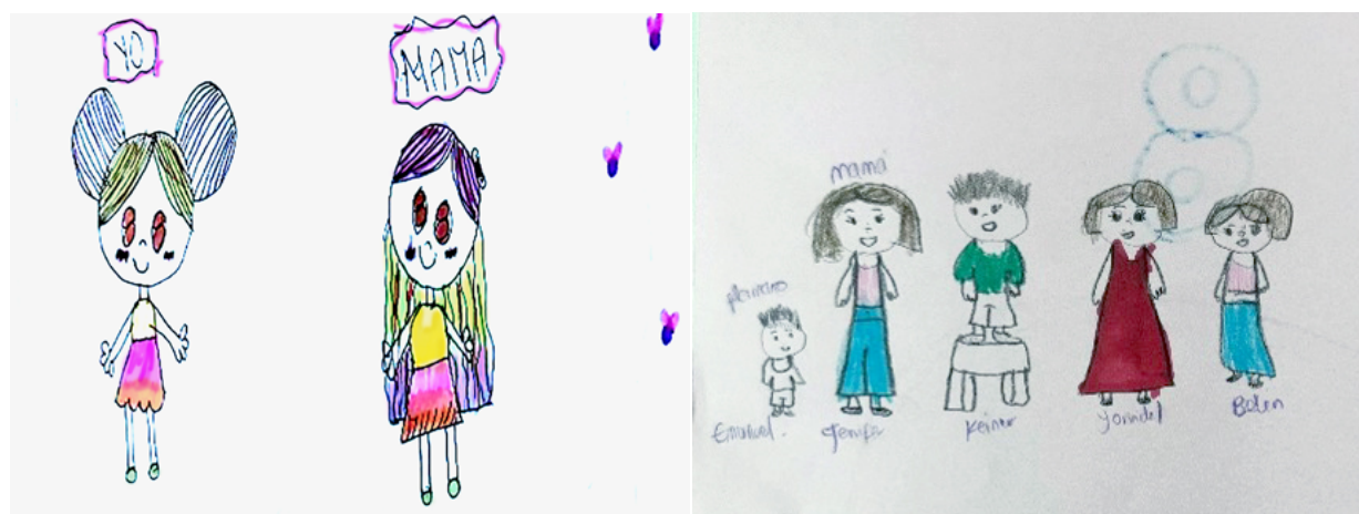
Figure 3. Single-parent family (2024)

Figure 2 shows the members of the extended family. One of its characteristics is to provide additional emotional and financial support, but it can also face challenges in terms of space and decision-making within the home and, in some cases, with regard to children. It is important to note that when we refer to the extended family, we are referring to its composition, not its size.